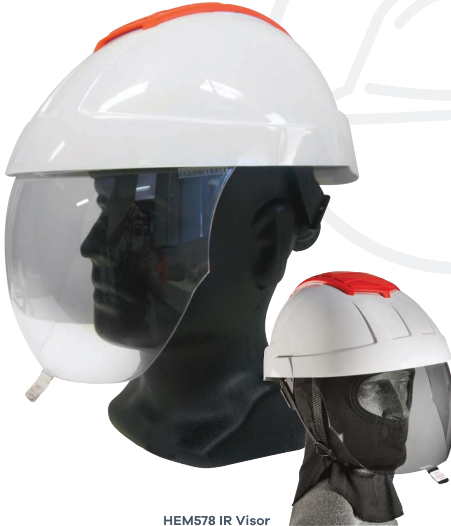
HEM578 IR Visor