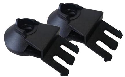
Replacement Visor Holder clips